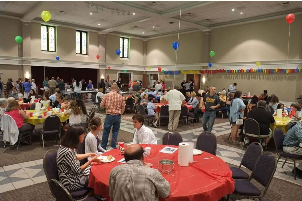
Back to School Low Country Shrimp Boil